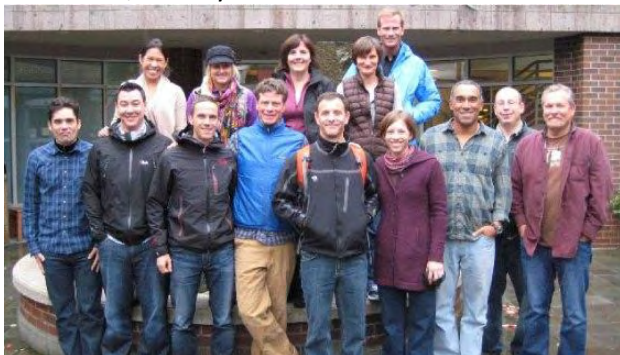
Conservation Alliance Board and Staff, November 2010

Each year, The Conservation Alliance membership votes to elect peers to serve on our Board of Directors. Two seats are up for election, or re-election, this year. We will complete that election before our August Board Meeting on Wednesday, August 3rd. These board positions consist of renewable, three-year terms.